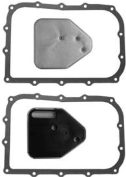
14 Bolt Pan 78-82 32010